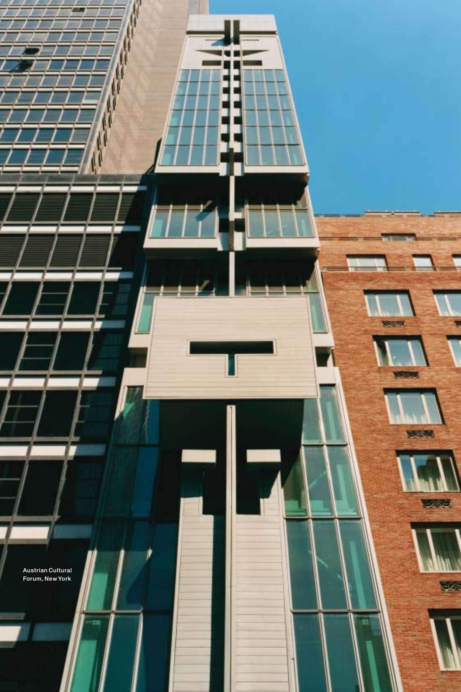
Austrian Cultural Forum, New York