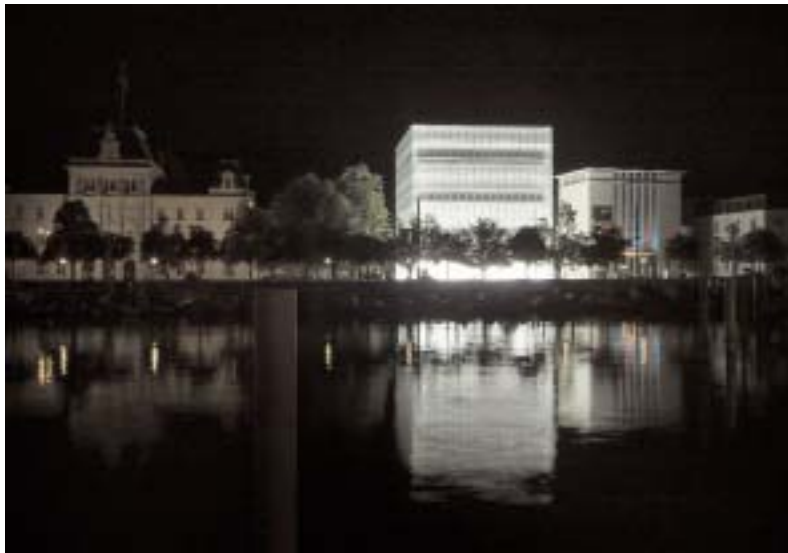
Siegrun Appelt 288 KW | 2005 Kunsthau Bregenz, 144 Thorn Mundial floodlights à 2000 watts/380 volts, transformers, distributor boxes, cable