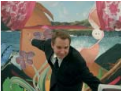
Jeff Koons, Kunsthaus Bregenz, 2001