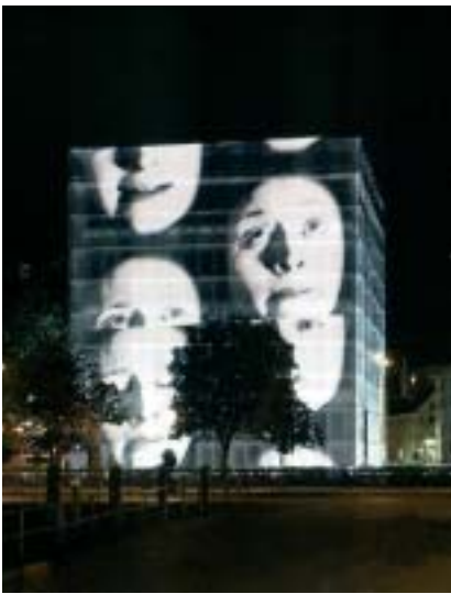
KUB facade, Video Projection, Tony Oursler, 2001