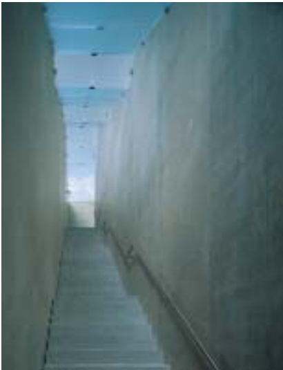
Foyer and staircase, Kunsthaus Bregenz

The KUB, which opened its doors in 1997, was designed by renowned Swiss architect Peter Zumthor. A recipient of numerous honors, the building ranks among the most important contemporary museum structures in the world. Conceived as a museum lit by natural light, the building captivates by virtue of its momentous exterior form and the uncompromising implementation of its spatial conception. The sublime formal and material aesthetic of the ground floor and the three upper exhibition levels stacked one on top of another makes for an integrated whole with great artistic potential. For artists, the architecture both sets the scale and provides the conceptual impetus for the production of their exhibitions, especially when entire series of works are produced to be shown at the Kunsthaus Bregenz. Consequently, the architecture is an indispensable platform for the idea Inside the Work.