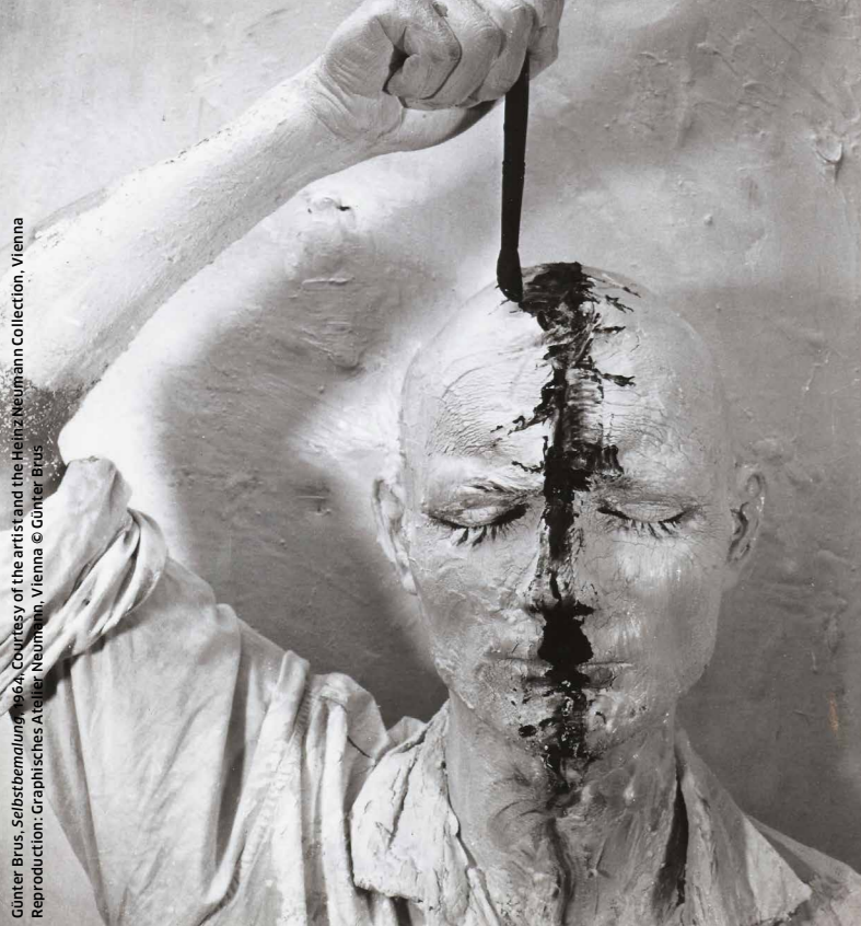
Günter Brus, Selbstbemalung , 1964. Courtesy of the artist and the Helmut Neumann Collection, Vienna. Reproduction: Graphisches Atelier Neumann, Vienna © Günter Brus